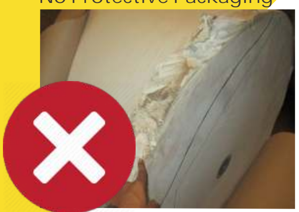
No Protective Packaging

www.rustx.net www.rustxusa.com info@rustx.net