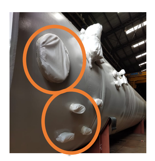
EPE foam on sharp areas